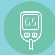
MEDICAL DEVICE & EQUIPMENT COVERAGE