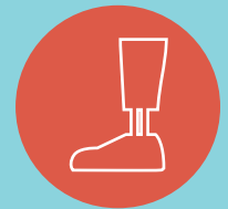
ARTIFICIAL LIMB COVERAGE