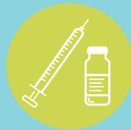
MEDICAL SUPPLY COVERAGE