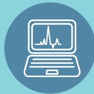
EDUCATION & TRAINING